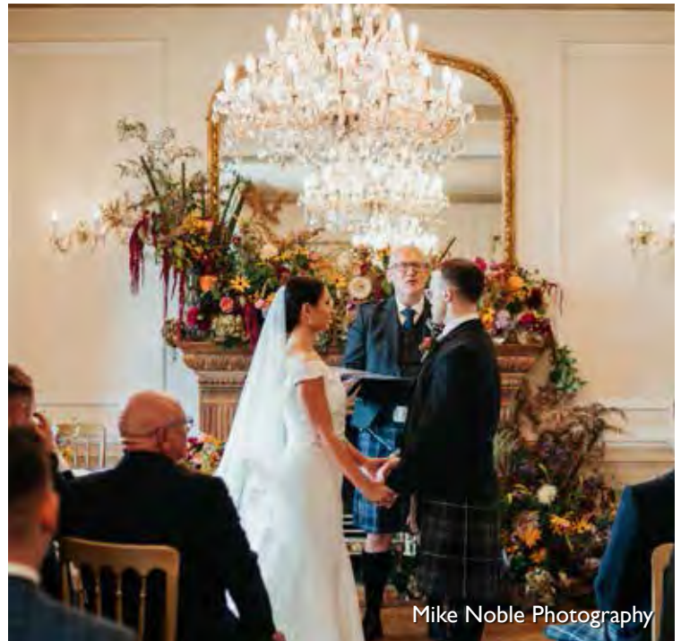
Mike Noble Photography