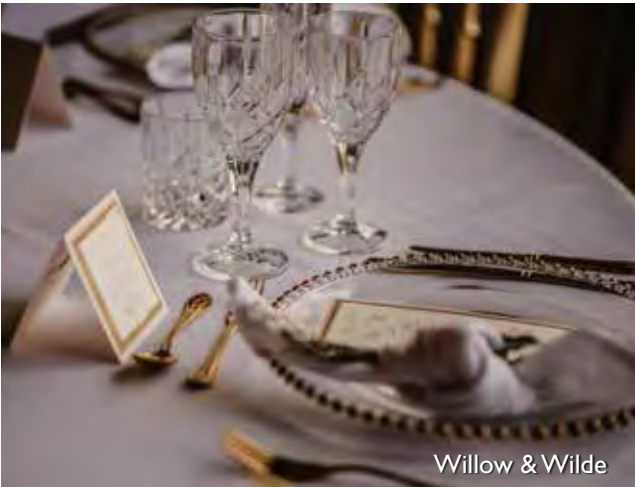
Willow & Wilde