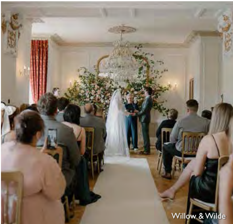
Willow & Wilde