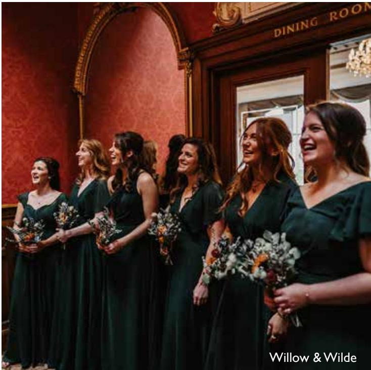
Willow & Wilde