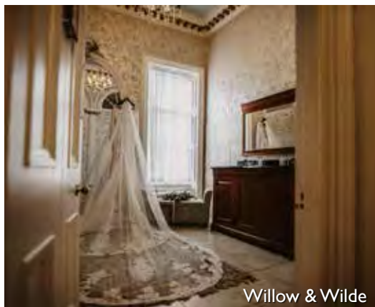
Willow & Wilde