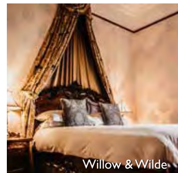
Willow & Wilde