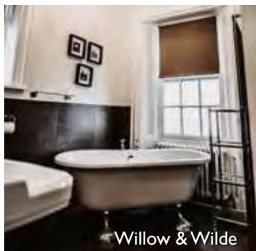
Willow & Wilde

Our four-poster suites are the jewels in our crown. Wonderfully spacious, they boast high ceilings and period features of Victorian opulence and have uninterrupted views of our private lake or Italianate gardens. All of our 26 en-suite bedrooms are simply perfect for a special occasion. Each has been individually styled to capture the essence of castle living and all boast a truly wonderful mix of grand furniture and little luxuries for a perfect stay.