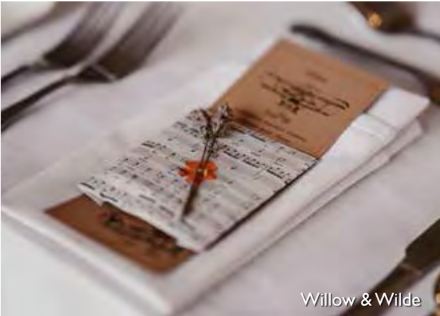
Willow & Wilde