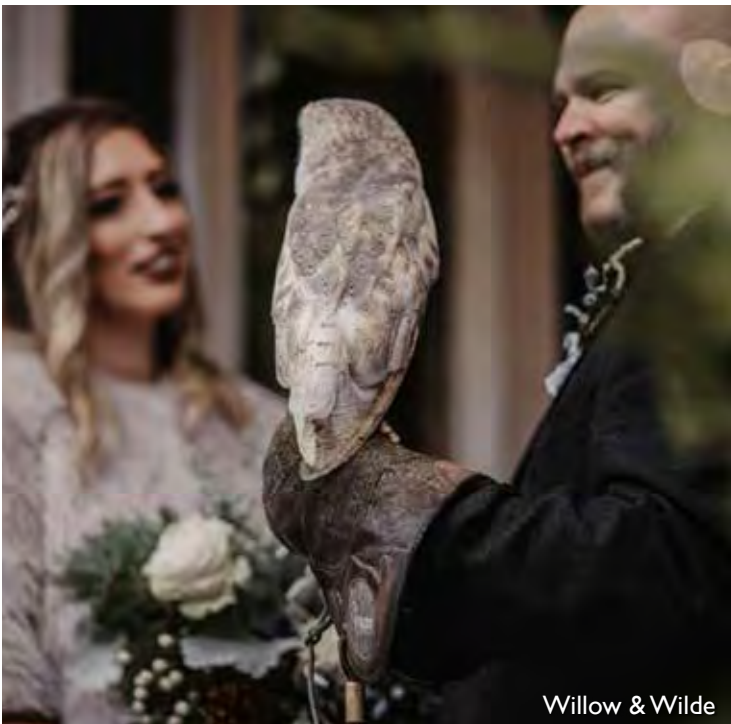
Willow & Wilde