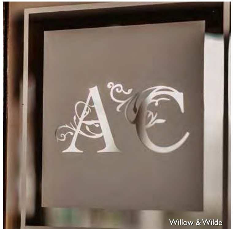
Willow & Wilde