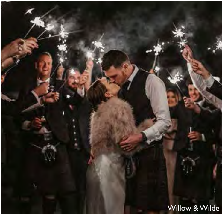
Willow & Wilde