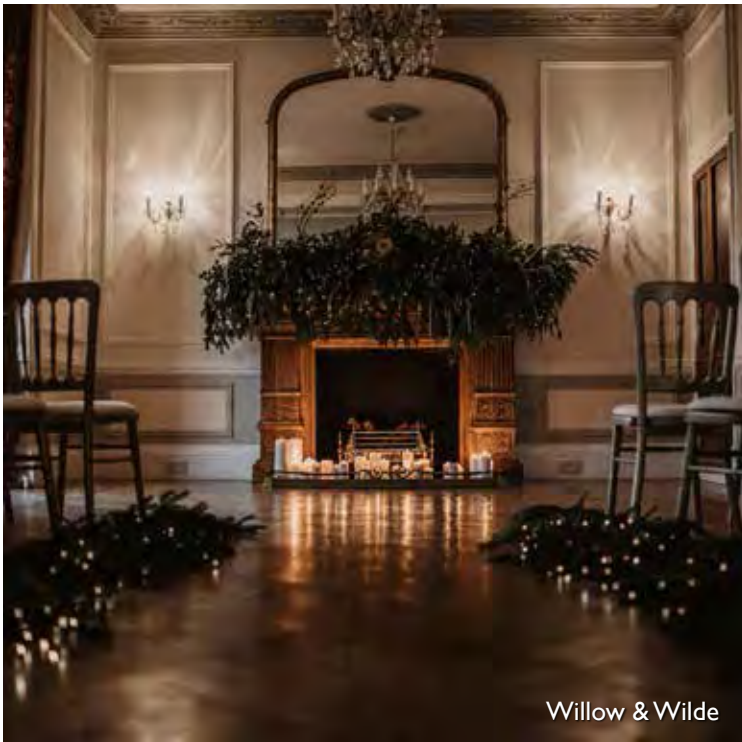
Willow & Wilde