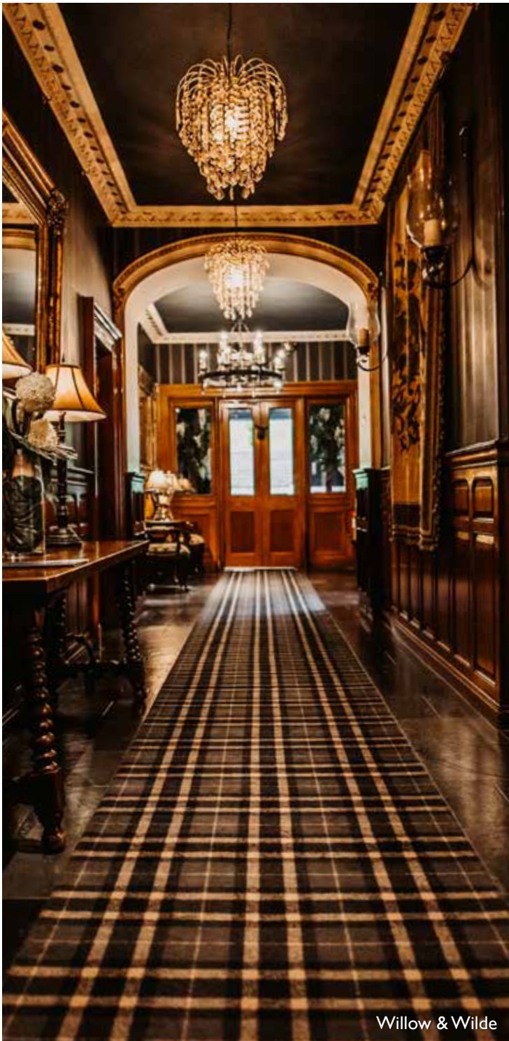
Willow & Wilde