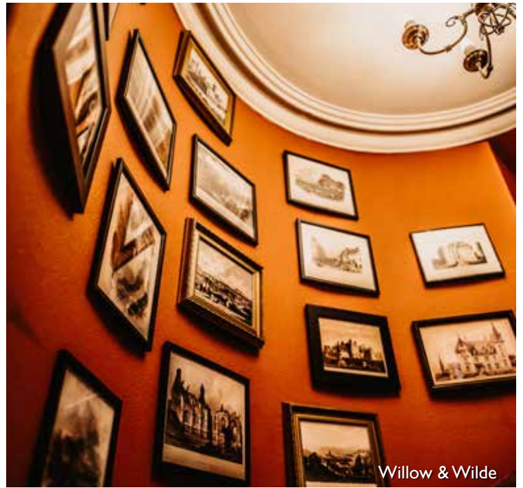
Willow & Wilde