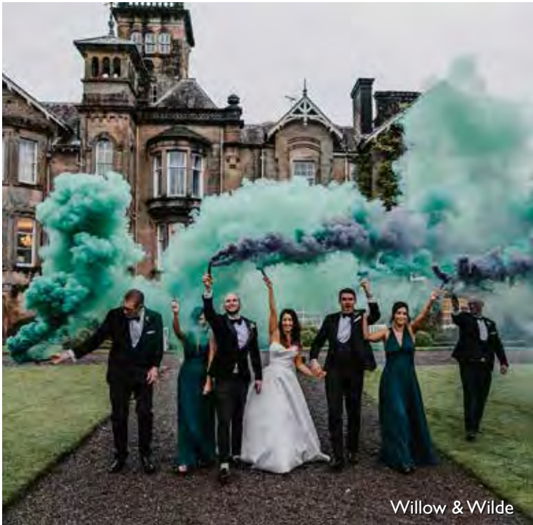
Willow & Wilde