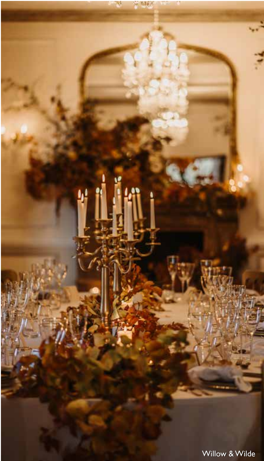
Willow & Wilde