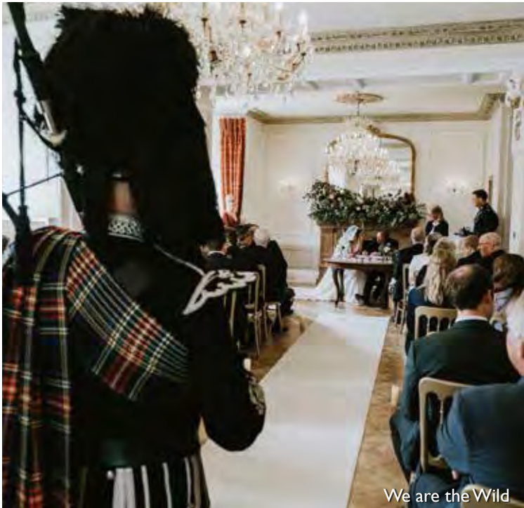
We are the Wild