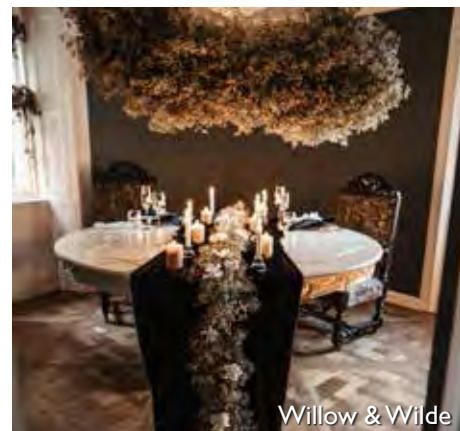
Willow & Wilde