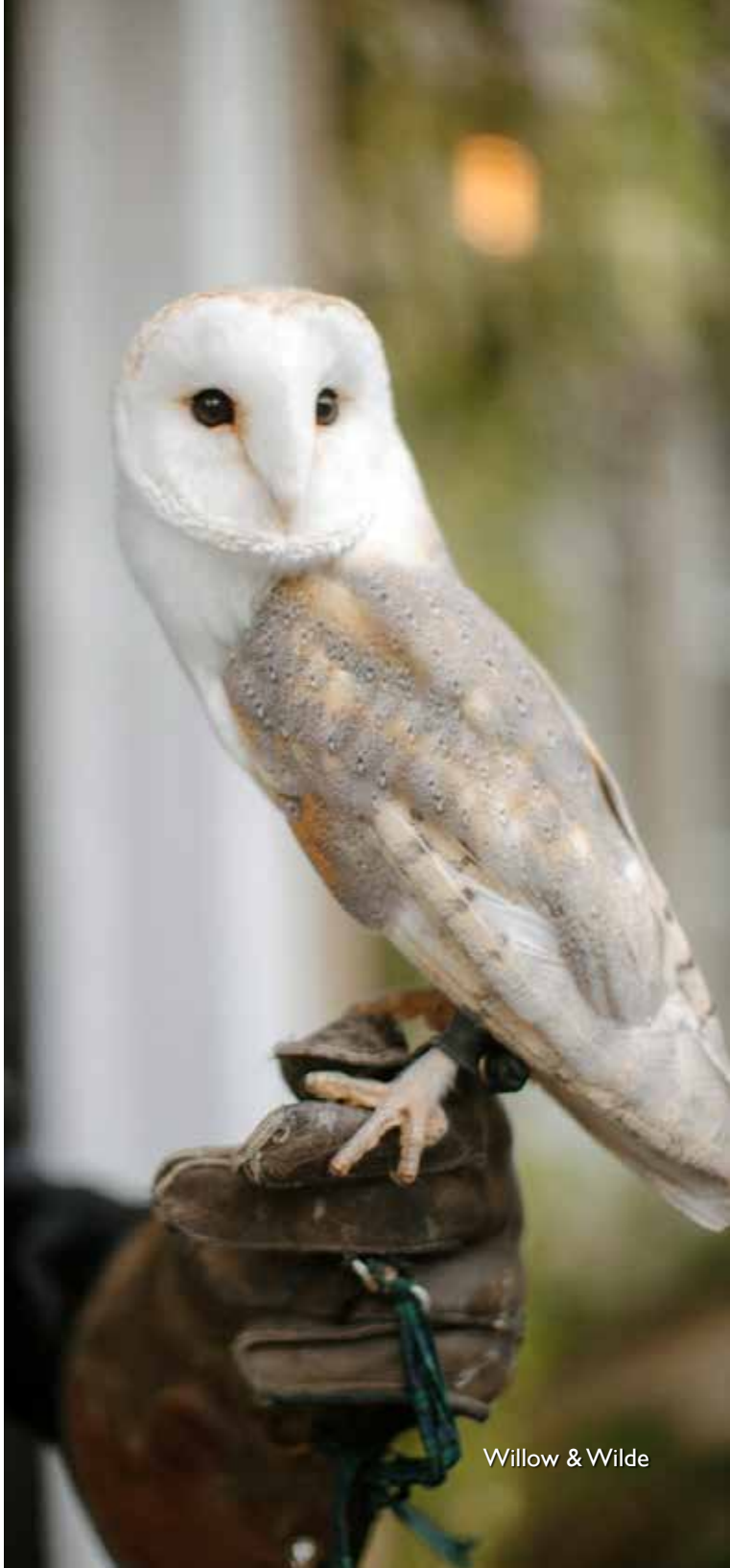
Willow & Wilde