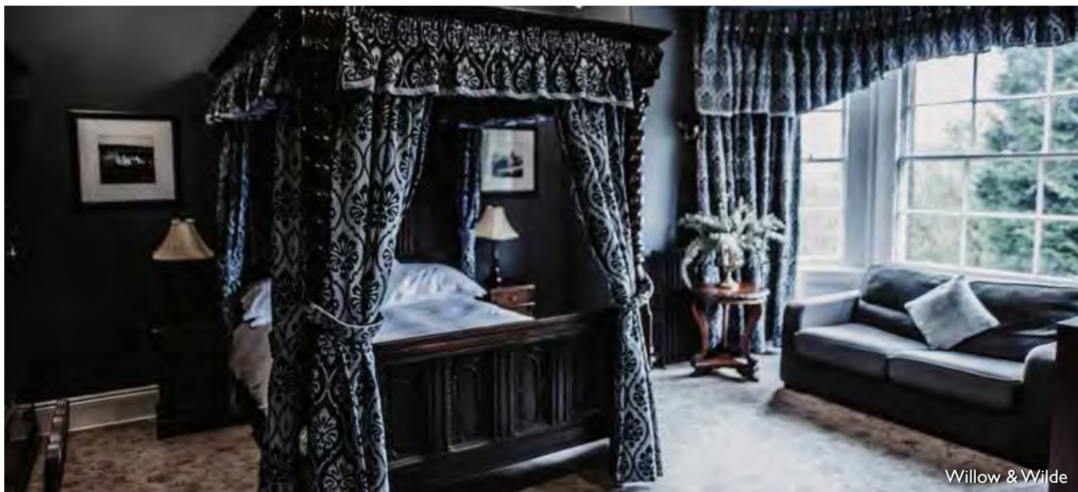
Willow & Wilde