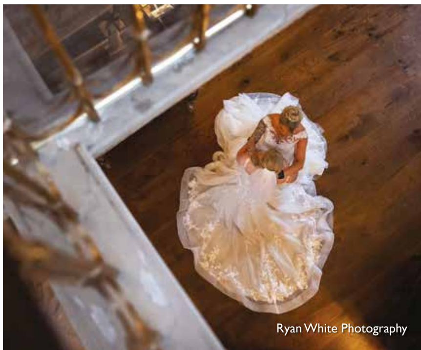
Ryan White Photography