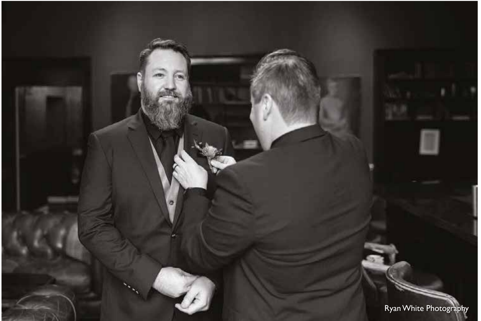
Ryan White Photography

From intimate fairy-tale weddings and secret elopements to exclusive opulent banquets for 150, our team is on hand to orchestrate your special day. Enchanting ballrooms, manicured gardens, a contemporary marquee and luxury rooms mesh together to create the perfect backdrop to any celebration. Capture memories in our magical location.